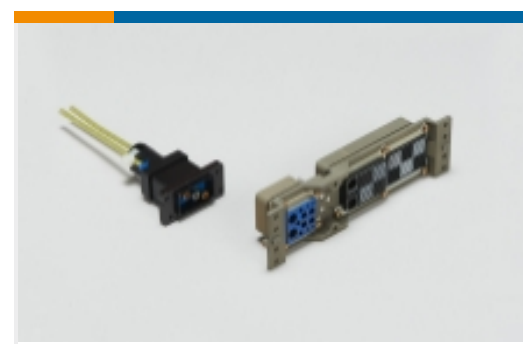
Rack &amp; Panel Connectors(1)